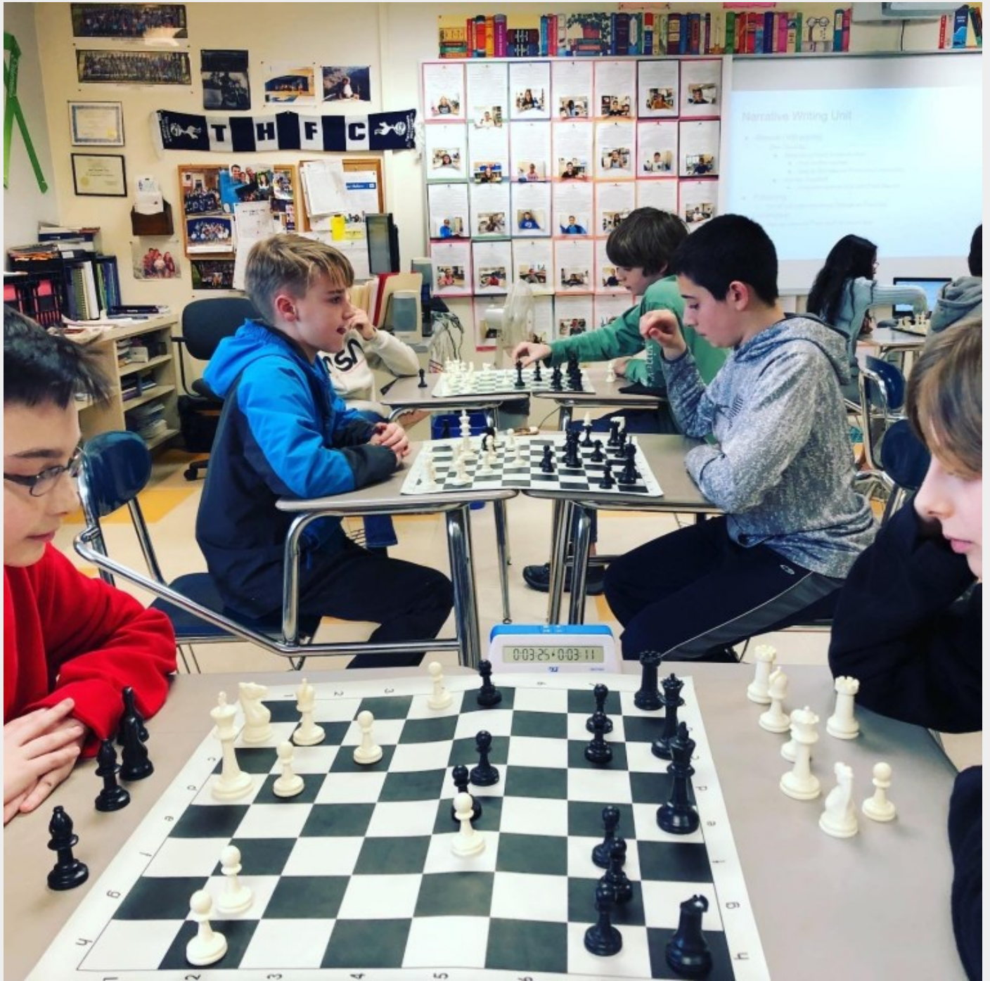
It was a packed house for the HKMS Chess Club tournament after school.