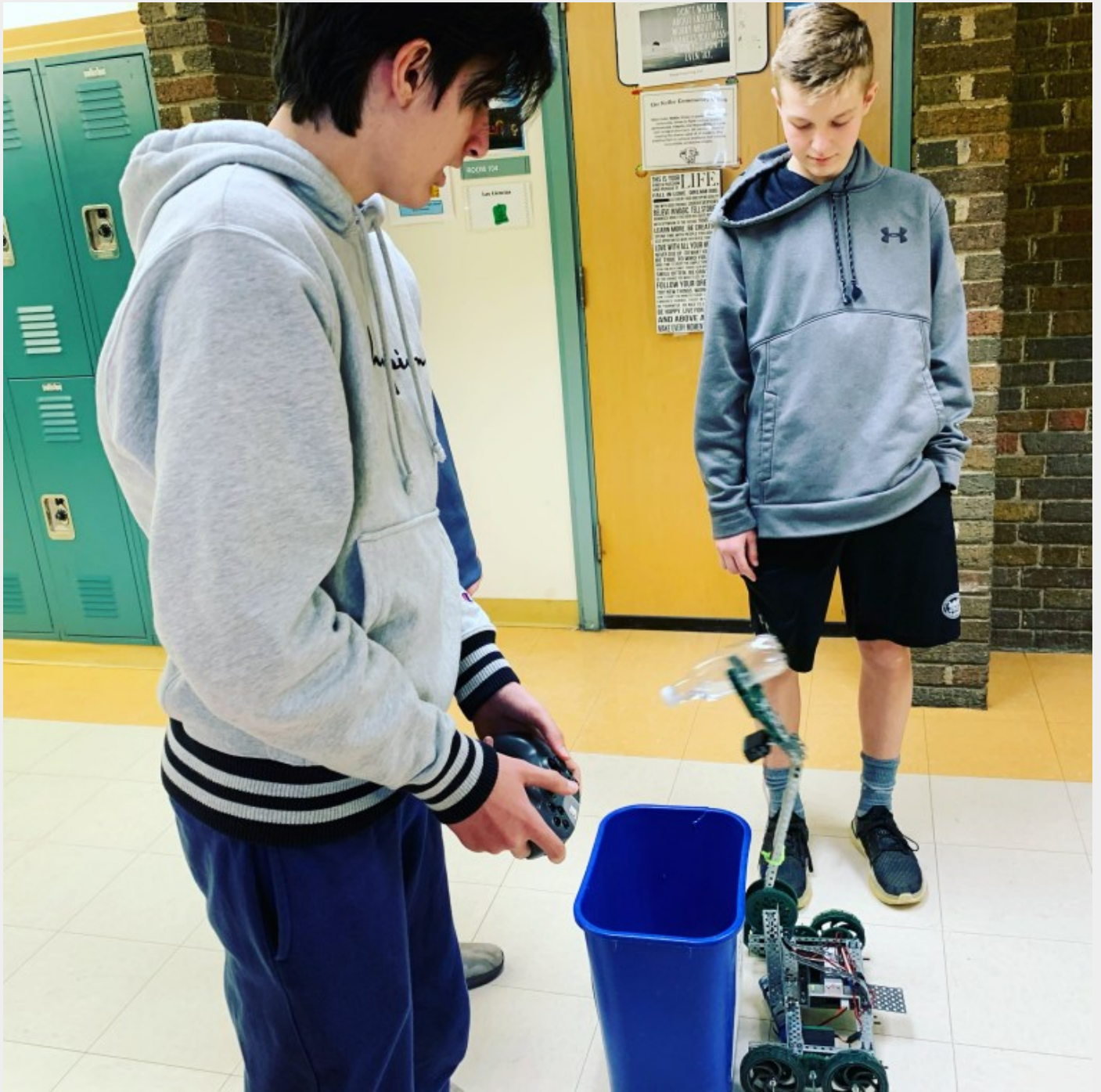
Eighth Grade students in their Project Lead the Way Engineering course are using their knowledge of gear ratios and torque to build and program useful robots.