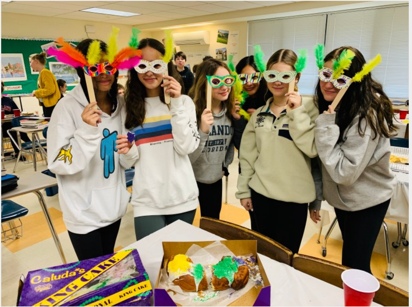
Eighth grade French students learned about Carnival celebrations in four different regions of the world, Nouvelle Orléans, Binche (Belgium), Nice (France), and Québec.