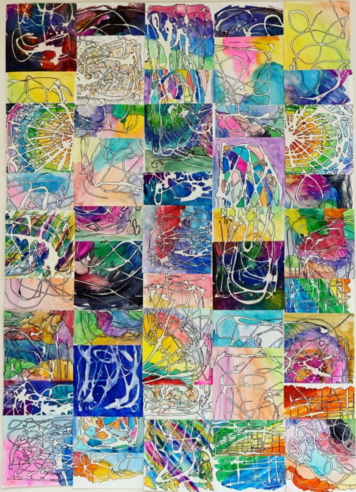
Art Club – 2019

A new artistic addition to the walls of HKMS created by our art club.