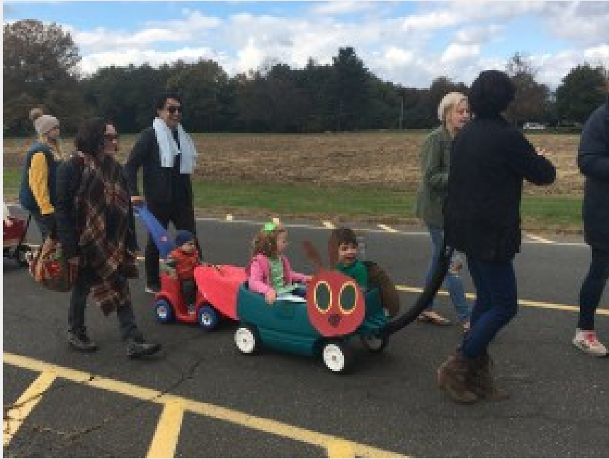
The Easton Public Library Storybook Parade marches along Morehouse Road.