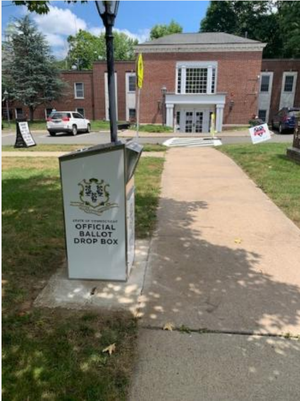
Easton's Official Drop Box across from the Easton Police Department

The General Election is now less than 40 days away. This will no doubt be a uniquely contentious election. We respect the rights of all people to speak their minds and post their posts and display their signs. At a time where civility is often lacking in national political discourse, I hope that we in Easton can be counted on to be respectful of each other.